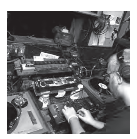
\textbf{DJ Gregory Dalphond} \ (\text{photo by James Rotz})