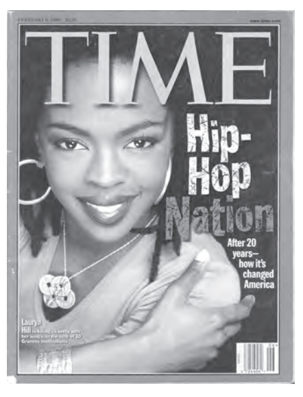
Magazines from the Murray Forman Collection